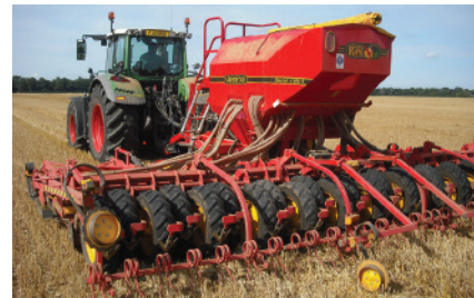
Cover crops being drilled into stubble.

The cover crop options below are not exhaustive and a wide range of options are available, such as phacelia, buckwheat and chicory. They have specific traits useful in certain circumstances; consult an agronomist for details.