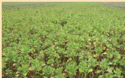
Black mustard cover crop.

Always read product labels, consider your local conditions and consult a professional agronomist, if necessary.