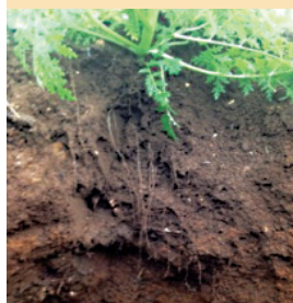
Cover crop roots open up soil structure.

Name James and Tim Sills Location Cambridgeshire/Suffolk border Size 1,000 ha Soil type Predominantly heavy Hanslope clay Rotation All combinable crops, incorporating straw